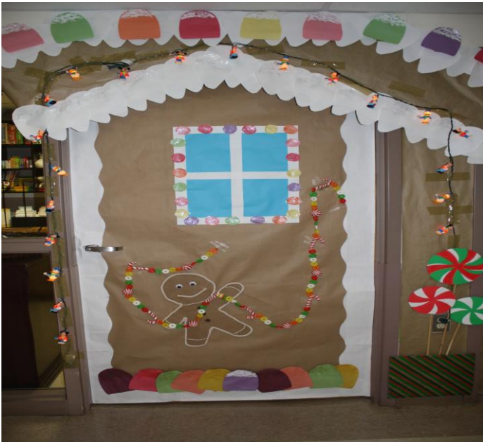
Winning Door completed by the Environmental Services Department...Congratulations!

Thank you for participation in all of these special events.